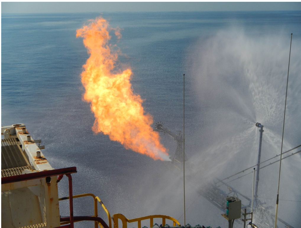
Boreas-1 Production Test

The Transocean Legend semi-submersible rig is drilling and testing the Boreas-1 well.