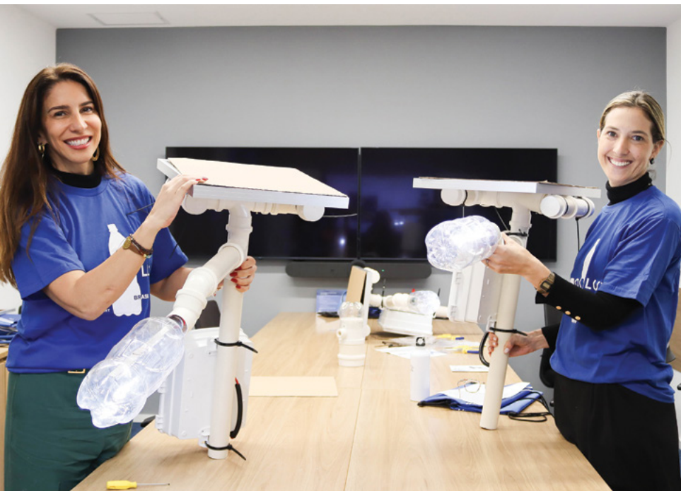
Volunteers from the Rio office for the Liter of Light project.

During the second half of 2023, these projects supported Karoon's commitment to prevent significant environmental impacts from production operations at the Baúna field.